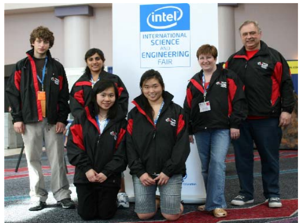
Our top 20 students were awarded trips to attend the Canada Wide Science Fair (CWSF) in Truro, NS, or the Intel International Science and Engineering Fair (IISEF) in Albuquerque, New Mexico .